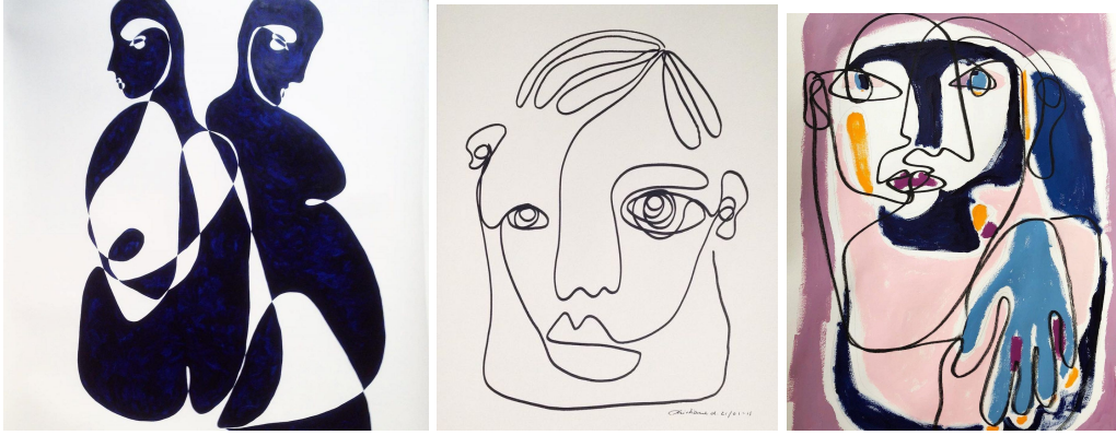
Artworks above by Christiane Spangenberg

A line is an identifiable path created by a point moving in space. It is one-dimensional and can vary in width, direction, and length. Lines often define the edges of a form. Lines can be horizontal, vertical, or diagonal, straight or curved, thick or thin. Lines are marks moving in a space between two points whereby a viewer can visualize the stroke, movement, direction and intention based on how the line is oriented. Lines describe an outline, and are capable of producing texture according to their length, angle, repetition and curve. Lines create shapes, spaces and movement. A continuous line drawing has only one starting point and one ending point throughout an entire composition.