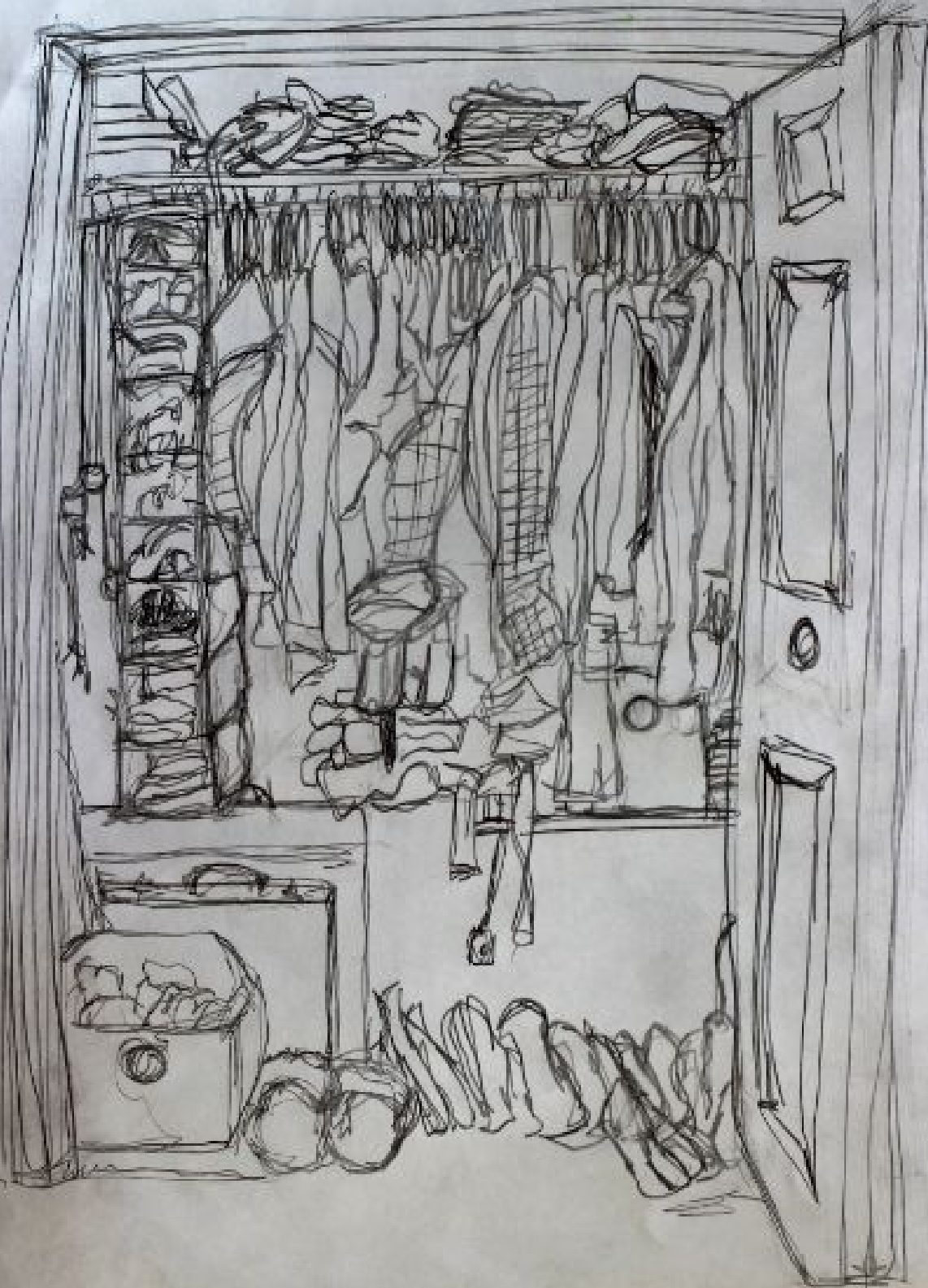
Drawing by Liz Borst